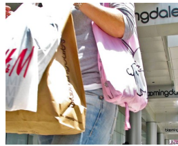
Debit cards poised to get much more expensive