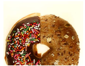
A reversal on carbs